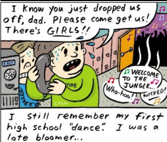
BY: CLAYTON HANMER. READ THE LIFE OF CTON AT dose.ca/cton